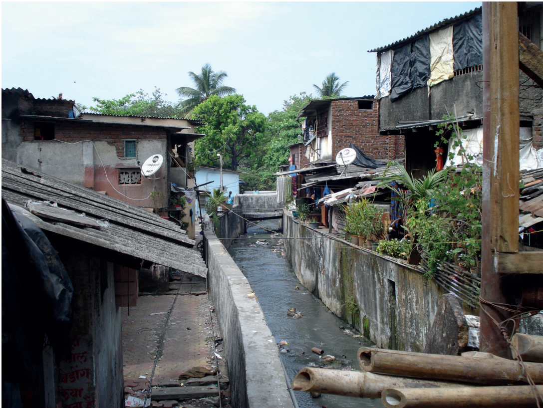
Photograph B for Question 3(a).

Permission to reproduce items where third-party owned material protected by copyright is included has been sought and cleared where possible. Every reasonable effort has been made by the publisher (UCLES) to trace copyright holders, but if any items requiring clearance have unwittingly been included, the publisher will be pleased to make amends at the earliest possible opportunity.