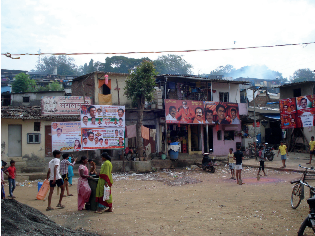
Photograph A for Question 3(a).